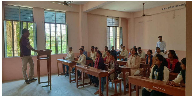
Guidance By faculty to student how to preparation CTET, STET, BPSC Gov. job.18/03/2023