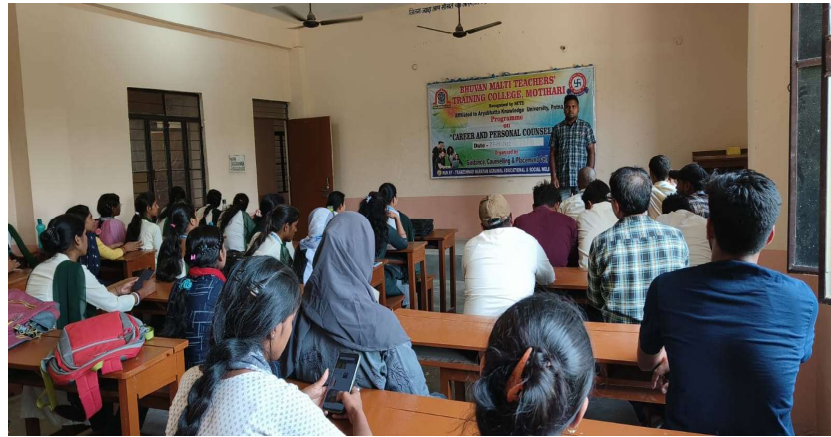
Faculty member guidance to student how to prepare CTET, BTET, STET, EXAMINATION. 23/11/2022