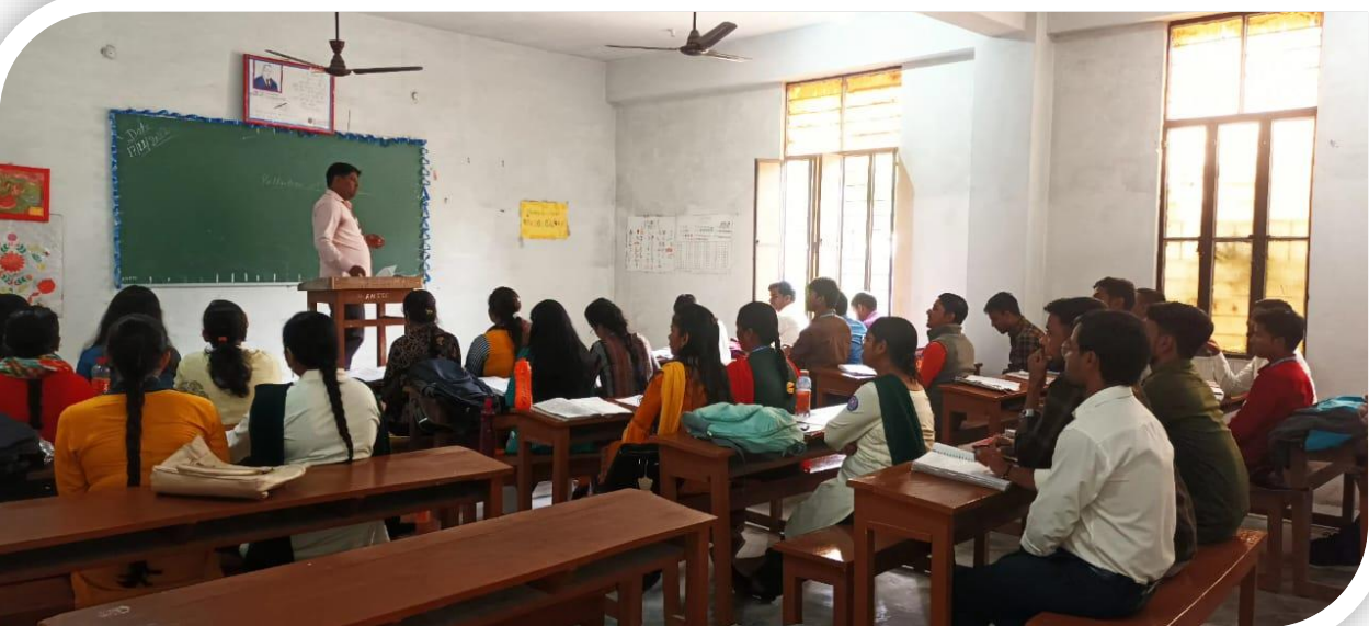
Alumni Discuss on in- House Curriculum Development